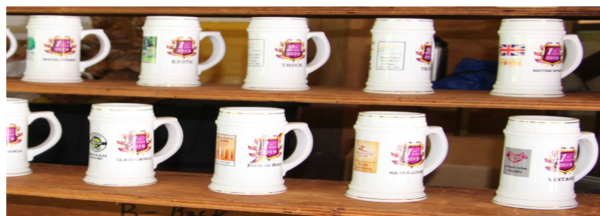
Additional Custom Sponsor Trophies - $ 100 ea.